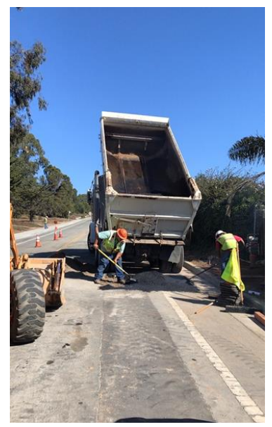
Temporary trench paving on Coe Ave